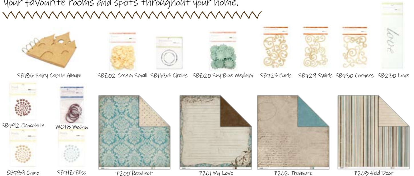
SB186 Fairy Castle Album

Show off your very own castle in this fantastic album. Capture your favourite rooms and spots throughout your home.