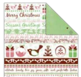
P299 Sleigh Ride