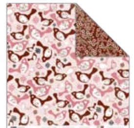
P297 Kris Kringle