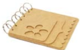
SB184 Fancy Flower Album