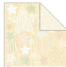
P263 First Steps