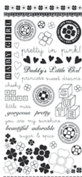
SB529 Little Miss