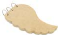
SB173 Wings Album