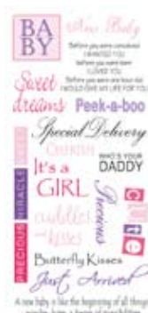
BR001 Baby Girl