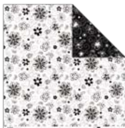
Ebony and Ivory Collection