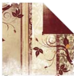
Elegance Paper Collection