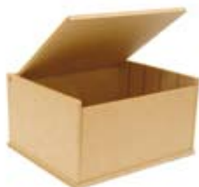
SB135 All Purpose Box