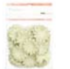
SB822 Medium Mint