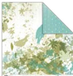
P284 Birds of Paradise