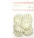
SB834 Large Mint