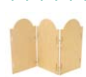
SB147 Bay Windows