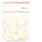
SB813 Medium White