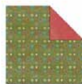
P148 Merry Christmas

To hang your Men separately cut away paper from the holes at the top and thread them with loops of ribbon.