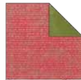
P151 Season's Greetings