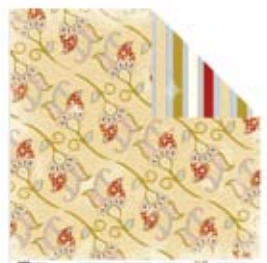
Tudor Paper Collection