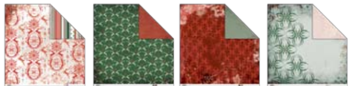
P300 Prancer P301 Dancer P302 Vixen P303 Comet

Choose a card to coordinate with your chosen papers. Cut a large rectangle 14.5cm x 10cm (5¾" x 4") and adhere to your card. Cut two circles of differing sizes and adhere to your card. On a piece of acetate, apply a rub-on and attach to your card. Embellish with ribbon, pearls and extra rubons if desired.