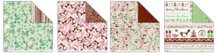
P296 Eggnog P297 Kris Kringle P298 Santa's Delivery P299 Sleigh Ride

Choose a card to coordinate with your chosen papers. Cut a large rectangle 14.5cm x 10cm (5¾" x 4") and adhere to your card. Cut out a title from the printed paper and adhere. Attach a scallop border underneath. Embellish with ric rac ribbon and pearls. Decorate with cut out designs from your paper to finish.