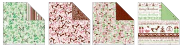
P296 Eggnog P297 Kris Kringle P298 Santa's Delivery P299 Sleigh Ride

Choose a card to coordinate with your chosen papers. Cut a large rectangle 14.5cm x 10cm (5¾" x 4") and adhere to your card. Cut a long rectangle border to sit just above the bottom edge of your card. Attach a painted wooden flourish, and embellish with rhinestones. Finish by rubbing on your title.