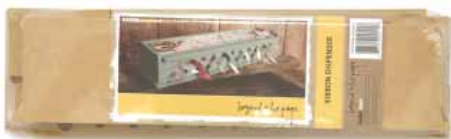
Kaiser scrapbook beyond the page Ribbon Box