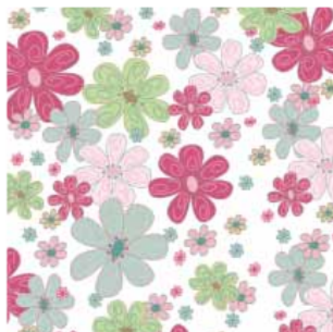
Kaiser scrapbook paper Selection pack: Spring

Think about what colour ribbons you are going to store in this ribbon box and if possible choose the color of your paint and paper accordingly.