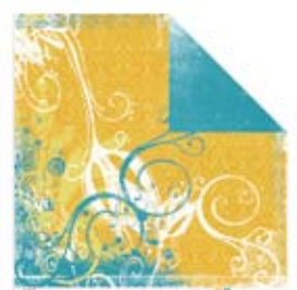
P115 Sand Dune