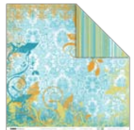
P112 Sea Spray