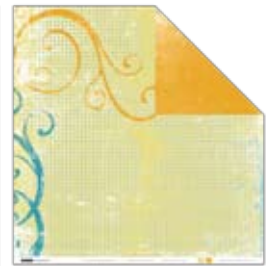
P114 Summer Breeze