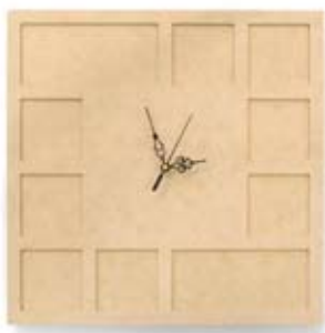
SB166 Frame Clock