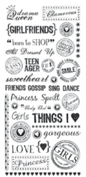
SB527 All Girl