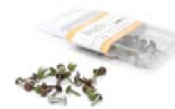
SB1204 4.5mm Camo