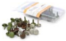
SB1210 8mm Camo