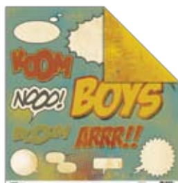
P252 Dare Devil