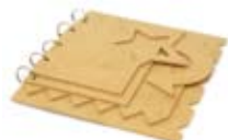
SB196 Star Designer Album