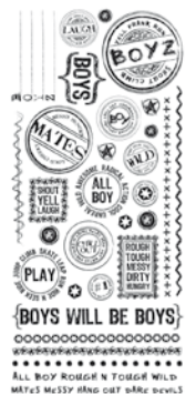
SB528 All Boy Rubons