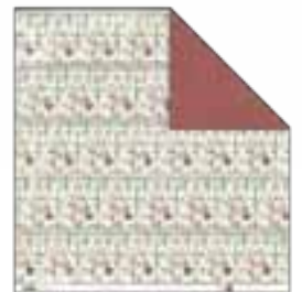
P304 Snow Finch

Embellish with more cut outs, rub-ons, ribbon and rhinestones. If you prefer, add a photo to the large tree tag.