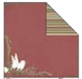
P307 Turtle Dove